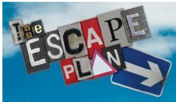
Groundswells research on leaving homelessness http://bit.ly/1eX5QgM